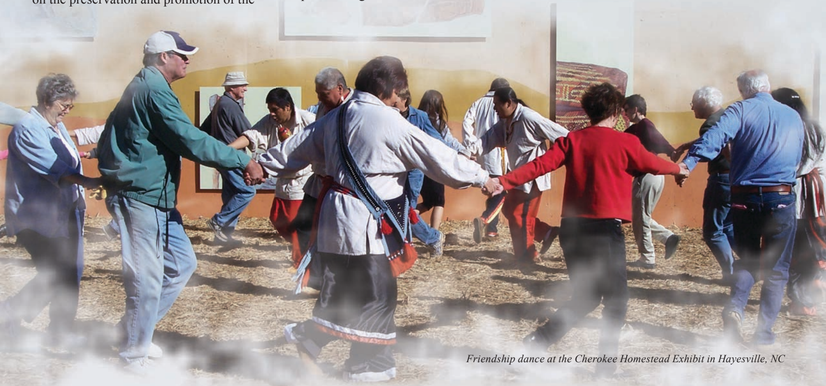
Friendship dance at the Cherokee Homestead Exhibit in Hayesville, NC

The BRNHA Partnership fulfills its mission through hundreds of collaborative partnerships with other nonprofits, governments, educational institutions, and private businesses. This partnership model makes it possible for BRNHA to leverage and match the federal dollars it receives. It also yields a greater economic return to the region, better coordination in the preservation of heritage resources, and an improved visitor experience.