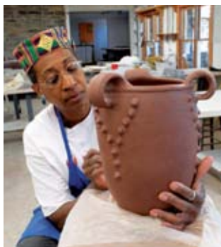
Crafter at Penland School of Crafts

A fertile meeting ground for European and African music traditions, the North Carolina mountains still ring with the sounds of the fiddle, banjo, string bands and cloggers, which can be heard everywhere from front porches to festival stages and town squares. The music includes lively strains of old-time, bluegrass, ballad singing,