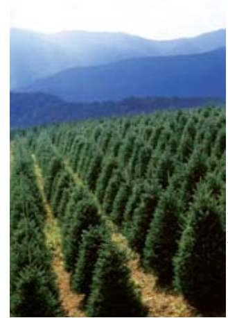
Avery County Christmas tree farm

than 30 wineries open to the public in the Blue Ridge National Heritage Area, many of which are located in the state's only two American Viticultural Areas. (See map and Web site on back.)