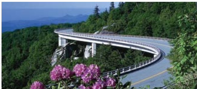
Blue Ridge Parkway / Linville Viaduct