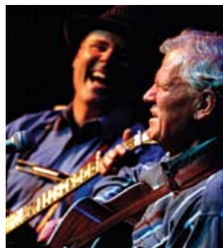
David Holt and Doc Watson at MerleFest